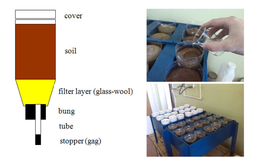
Fig. 1. Laboratory installation

In the experiment, four types of soil were used: sand, sandy, loamy and clay, and two kinds of organic fertilizers. Fertilizer 1 (low mineralized organic fertilizer) – matured within 3 months poultry manure – a typical fertilizer widely used for the region. The second organic fertilizer (with a higher mineralization of nutrients) is a little-used but promising fertilizer obtained from the same poultry manure with the help of an accelerated composting (biofermentation technology). Main results were obtained according to the soil with fertilizer 1. The results for the soil with fertilizer 2 will be used to predict changes in the situation of removal of nutrients to water at the transition to the use of fertilizer 2. The results for the soil without fertilizers will be used for unused agricultural fields, on which fertilizers are not used.